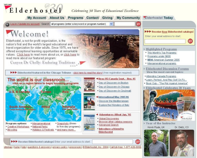
Figure 2. Screenshot of www.elderhostel.org/welcome/home.asp