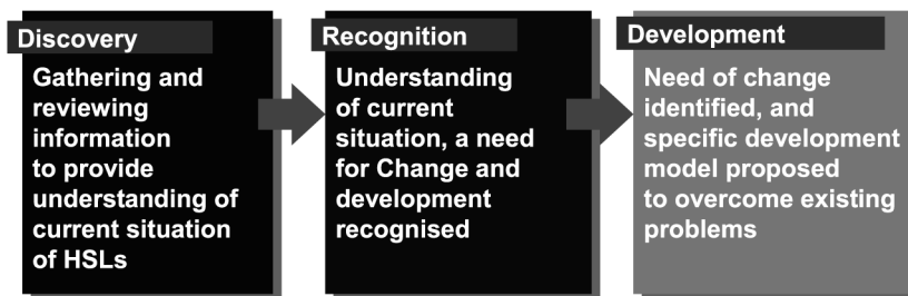
Figure 1. Steps for change and development